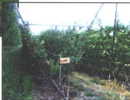
Fig. 8. Washington State apple trees being grown on a 'V' system.

days of touring, it was clear that many growers have made considerable progress towards new production technologies that primarily embody the concept of a fruiting wall combined with high density planting.