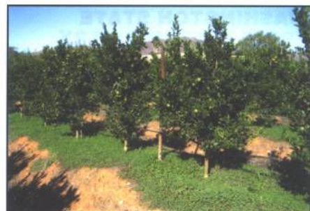
Fig. 10. 'W. Murcott' trees on x639 rootstock in South Africa. The trees were planted in 2003 at 6.5 x 15 feet and are being trained to form a fruiting wall on a 4-wire trellis.