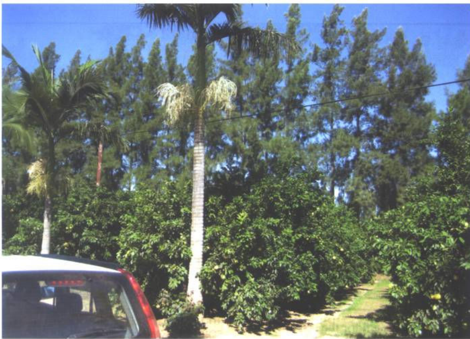
Fig. 2, left. A South African grapefruit grove planted with a windbreak of Australian pine, Casuarina cunninghamiana , for wind scar protection.