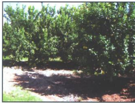
Fig. 3. A 5-year-old South African lemon orchard of trees on rough lemon rootstock spaced 5 x 16 feet and managed with the Open Hydroponic System using a single drip line. The trees are producing about 600 boxes/acre.

The same system can be installed in a mature grove. The main difference is that the water and nutritional requirements of the young trees will