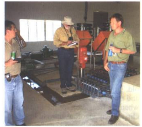
Fig. 1. Inside an Open Hydroponic System control facility in South Africa showing the piping, controller, pumps (above) and the fertilizer tanks (below).