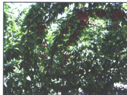
Fig. 9. Washington State sweet cherry trees under evaluation on a 'V' trellis system.