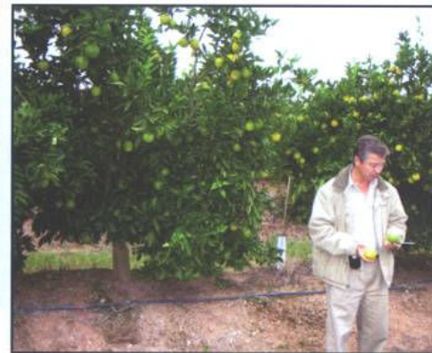
Fig. 4. 'Turkey' sweet orange trees on Swingle citrumelo rootstock being grown in South Africa on the Open Hydroponic System with a single line of drippers. The trees were planted in 2002 at 5 x 16 feet and most recently produced about 500 boxes/acre.

One of the primary goals of the OHS is to manipulate the tree and crop to favorable ends. That means for newly planted trees, growing them vigorously to establish canopy volume, and then redirecting the tree