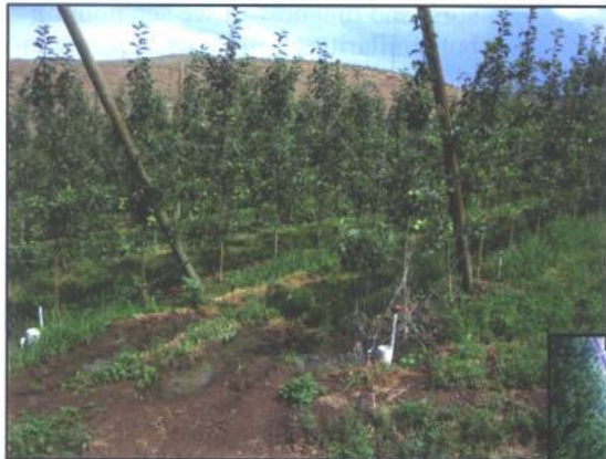
Fig. 7. A modern high density trellised apple orchard in the Yakima fruit growing region of Washington.