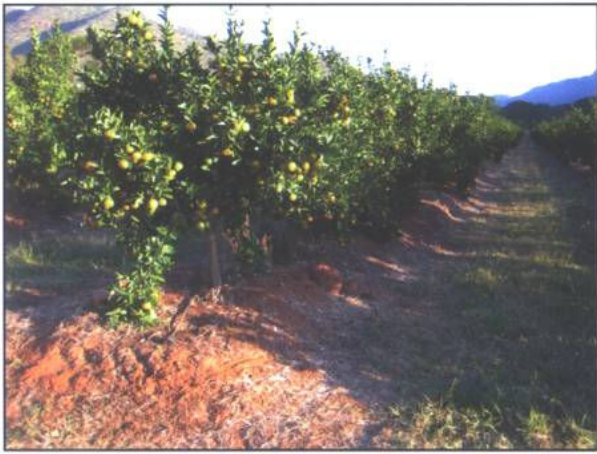
Fig. 5. 'W Murcott' trees on Carrizo citrange in a South African fresh fruit orchard. The trees were planted 5 x 16 feet on small ridges in 2003. They most recently have yielded about 300 boxes/acre. The trees are being grown on the Open Hydroponic System with drip irrigation. Fruiting was induced by girdling.

high yield provides for economic returns and managing diseases. Furthermore, the OHS may directly benefit our plant improvement team because we can speed up the development and evaluation of new varieties and, thereby, deliver them more quickly to our growers.